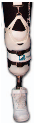
AOPPS post-op system

We believe in building life-long relationships, and we expect to provide outstanding patient care services.