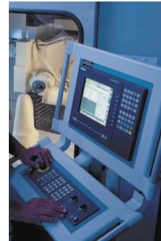
CAD/CAM carver brings digital precision to forming socket molds.

Starting with information from a direct scan or negative cast of the residual limb, CAD/CAM software presents a visual image of the limb from which the prosthetist can design a socket on a monitor, optimizing the overall shape and trimlines and adding build-ups and reliefs as necessary. Finally, the CAD/CAM system feeds the design to a carver, which that creates a positive model over which the shell of the definitive socket can be vacuum-formed.