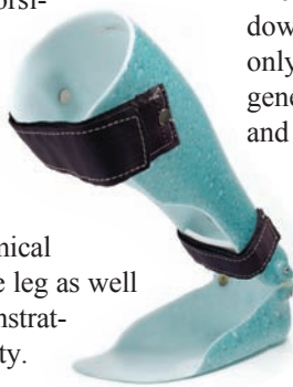
Articulated AFO

Articulated AFO —This design, featuring medial and lateral hinge joints closely aligned with the anatomical ankle joint and trimlines encompassing the sides of the leg as well as the back, provides added support for patients demonstrating drop foot along with medial and/or lateral instability. The articulated AFO can also help control knee hyperextension resulting from quadriceps weakness.