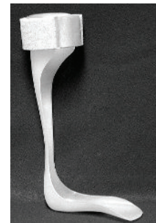
Posterior leaf spring AFO.

Posterior leaf spring AFO —In general, our approach with any orthosis is to provide the lightest and least-complex device that will get the job done. In the early stages of MS and ALS, that objective is generally best delivered by a custom-molded posterior leaf spring AFO, a simple L-shaped brace that provides necessary support primarily behind the ankle and under the foot and adds a degree of dorsiflexion assist. Width and thickness are customized to reflect the strength and weight of the patient. With its thin profile and light weight, this AFO enjoys a high level of patient acceptance.