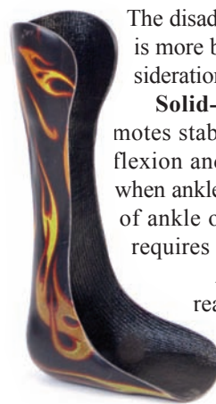
Solid-ankle AFO

Solid-Ankle AFO —This rigid construction promotes stability in all planes by preventing both dorsiflexion and plantar flexion. It is an appropriate choice when ankle motion must be controlled, as in the presence of ankle or knee instability or when ankle spasticity requires counter-resistance.