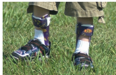
Pediatric articulating AFOs