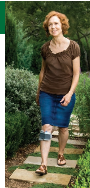
FES unit for drop foot