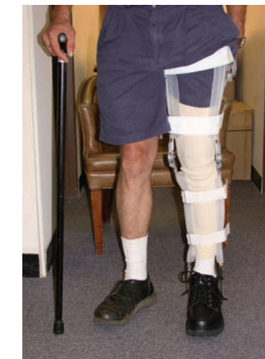
Knee-ankle-foot orthosis