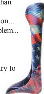
Laminated Solid-ankle AFO

In the certified orthotist, rehabilitation decision-makers have at their disposal an AFO expert who can help them achieve optimal outcomes for their patients. Call us for details.