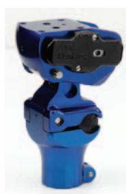
GeoFlex™ polycentric knee

Polycentric designs, frequently incorporating a four-bar linkage system, provide a moving center of rotation keyed to the degree of knee flexion. This arrangement yields varying mechanical stability throughout the gait cycle: enhanced stability at heel-strike to reduced stability at toe-off, permitting easier commencement of leg swing. The polycentric design also effectively shortens the length of the shank during the swing phase, increasing ground clearance and reducing the potential of stumbling. Polycentric knee joints are uniquely applicable for patients with a knee disarticulation, a short above-knee amputation, and/or weak hip extensors.