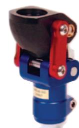
MightyMite® 4-bar knee for geriatric and pediatric patients