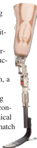
Above-knee prosthetic limb incorporating Total Knee polycentric unit with hydraulic control and stance lock

Another locking approach is the weight-actuated stance-control knee , originally known as the "safety knee." This unit functions as a constant-friction knee during leg swing but is held in extension by a braking mechanism as weight is applied during stance phase.